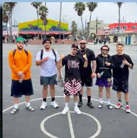
The "Who Splashin'" Basketball Game Crew Takes a Group Flick Post-Game July 12th, 2024 at the Venice Beach Basketball Courts in Santa Monica