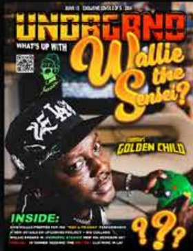
WALLIE THE SENSEI