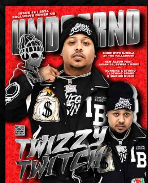
TWIZZYTWITCH EXCLUSIVE COVER 5/5