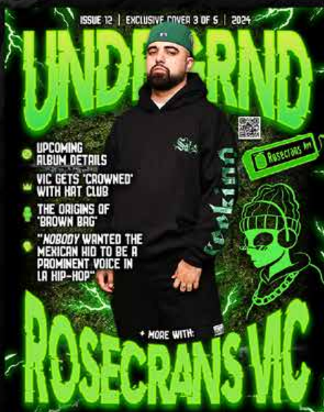
ROSECRANS VIC EXCLUSIVE COVER 3/5