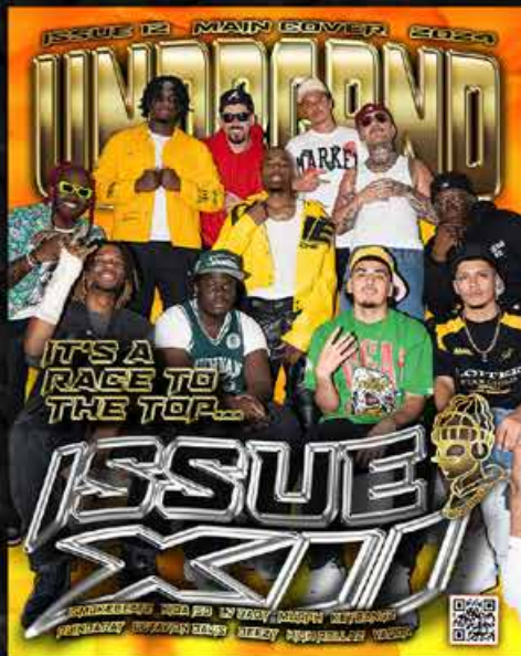
ISSUE 12 MAIN COVER LINEUP