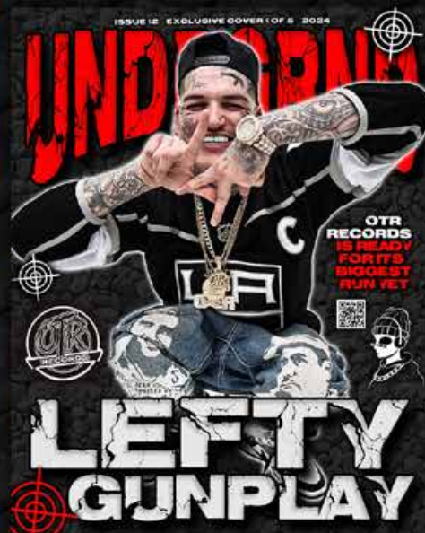
LEFTY GUNPLAY EXCLUSIVE COVER 1/5