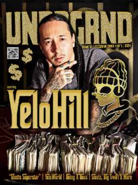
YELOHILL EXCLUSIVE COVER 4/5