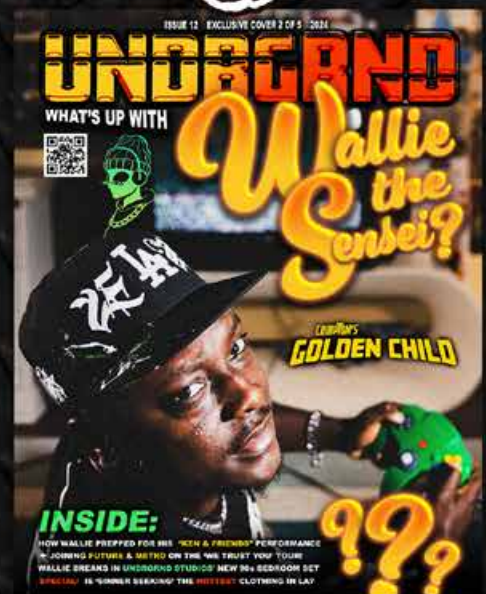
WALLIE THE SENSEI EXCLUSIVE COVER 2/5